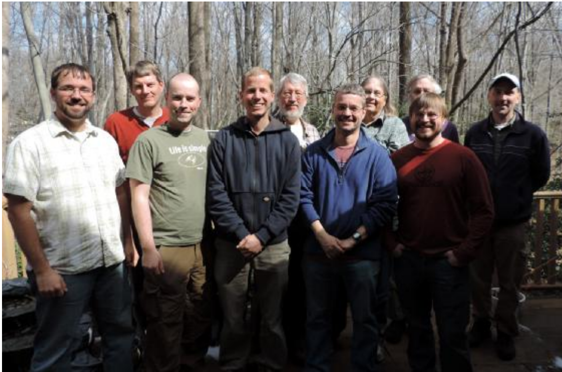
The 2013-2014 term Maryland/District of Columbia Records Committee.