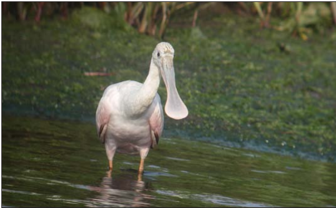
Photo of Roseate Spoonbill in North Assawoman Bay.