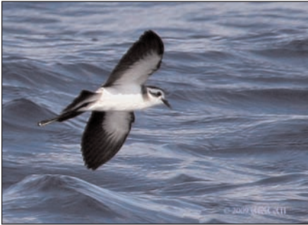
White-faced Storm-Petrel in Worchester waters on August 22, 2008.