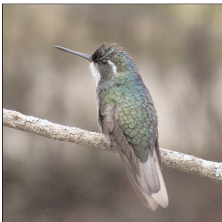
White-throated Mountaingem in Costa Rica.

centered on two areas. We spent the first 4 days in the Caribbean lowland rainforest, where we saw Crested Guan, Rufous Motmot, Montezuma Oropendola, Great Curassow, Great Green Macaw, wood-creepers, antbirds, flycatchers, toucans, parrots, hummingbirds, and tanagers (not to mention the deadly snakes, poisonous “bullet” ants, and tree frogs). Beyond birding, highlights included a visit to the Tirimbina Reserve with a lecture on bat behavior and mistnetting activity, a leisurely rafting expedition down the Puerto Viejo River, and a visit to a Dole banana plantation. (Who knew that bananas take 9 months to mature, and that each plant produces only one bunch and is then cut down?) We then traveled to the southern oak-forest mountain region (8,000 ft), where we saw (among others) the Resplendent Quetzal, Ochre-bellied Flycatcher, Collared Redstart, Silky Flycatcher, Yellowish Flycatcher, Flame-throated Warbler, Roadside Hawk, and hummingbirds almost too numerous to mention, but which included the Bronze-tailed Plumeleteer, White-throated Mountaingem, and Magnificent, Volcano, and Scintillant Hummingbirds. All told, the group saw over 246 different species of birds, most of them life birds for many of us. Some of the group are already planning a return trip.