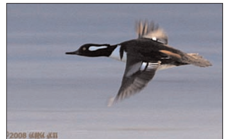
Hooded Merganser at Liberty Lake, Carroll County on January 18, 2008.